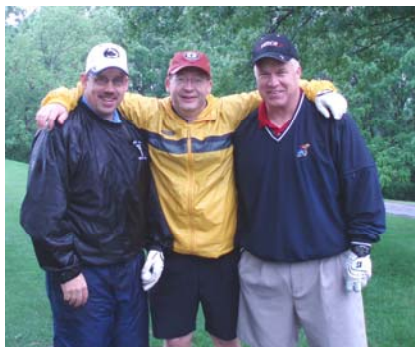
Sunny Golfers on a cloudy day!

Friends of LCCM Graystone Bank Lebanon Country Club Lebanon Federal Credit Union Lebanon Valley Golf Course Quill Corporation